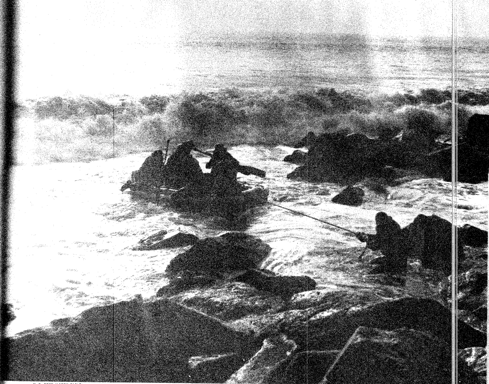
U. S. NAVY (LARRY CAGLE)

provided invaluable code and technical information.